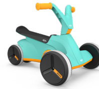
BERG GO Twirl Turquoise