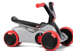
BERG GO 2 SparX Red