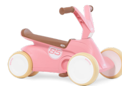
BERG GO 2 Retro Pink