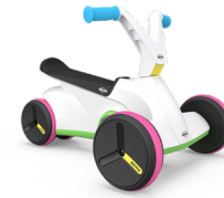
BERG GO Twirl Multicolor