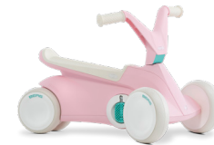
BERG GO 2 Pink