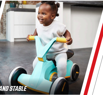
SAFE AND STABLE