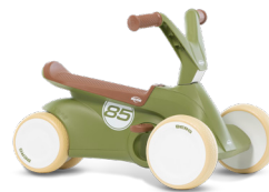
BERG GO 2 Retro Green