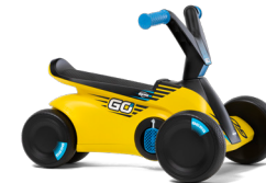
BERG GO 2 SparX Yellow