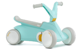
BERG GO 2 Mint