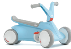
BERG GO 2 Blue