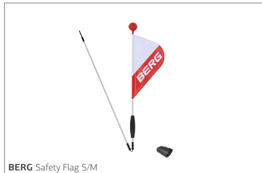
BERG Safety Flag S/M