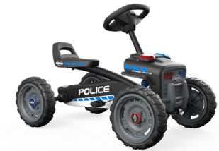
BERG Buzzy Police