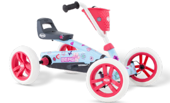
BERG Buzzy Bloom