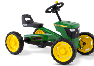
BERG Buzzy John Deere