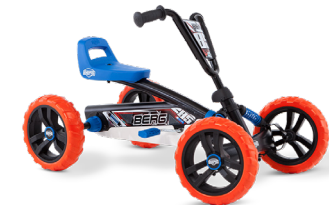
BERG Buzzy Nitro