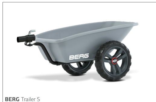
BERG Trailer S