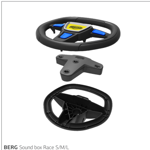
BERG Sound box Race S/M/L