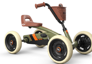
BERG Buzzy Retro