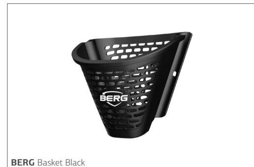
BERG Basket Black