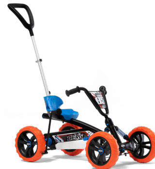
BERG Buzzy 2-in-1 Nitro