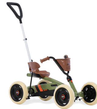
BERG Buzzy 2-in-1 Retro