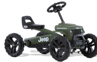
BERG JEEP Buzzy Sahara